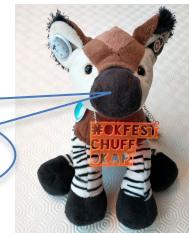
Chuff the OKF Okapi