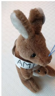
AMI, semantic Climate