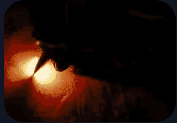
Us writing our CoC (...and never using it)