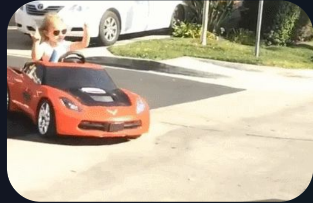
Us on our way to release 2023.1